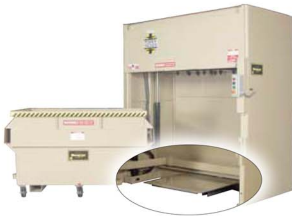
Container Support System